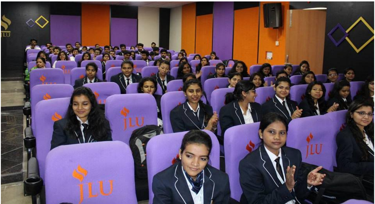
Students applauding the address of eminent speaker.