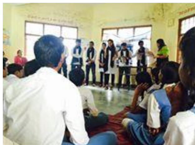
SOL Students performing the skit in front of school students