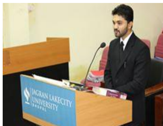
In Pictures: Judges assessing the participants, where participants making giving their best.