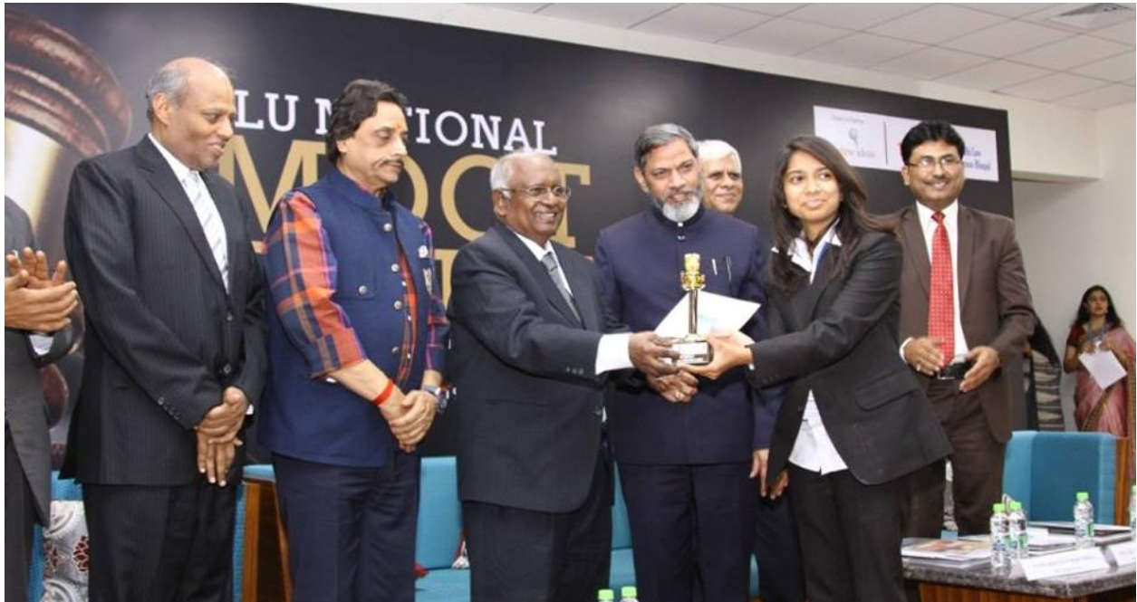
Dignitaries awarding the winners with a trophy and prize money.