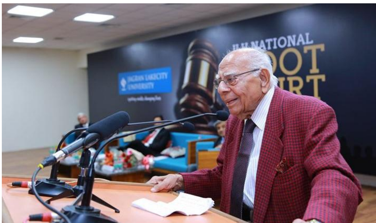
Advocate Mr. Ram Jethmalani addressing the gathering.

The event was inaugurated with grandeur by Mr. Ram Jethmalani, former Law Minister and senior advocate, Supreme Court of India. In his address of more than 90 minutes, he urged students to choose litigation as a career path and also shed light on the scope and opportunities of the field. He opined that the law profession is one of dignity and honor and earning money is secondary. He also lauded the efforts of School of Law for organizing a national level competition in its nascent stage.