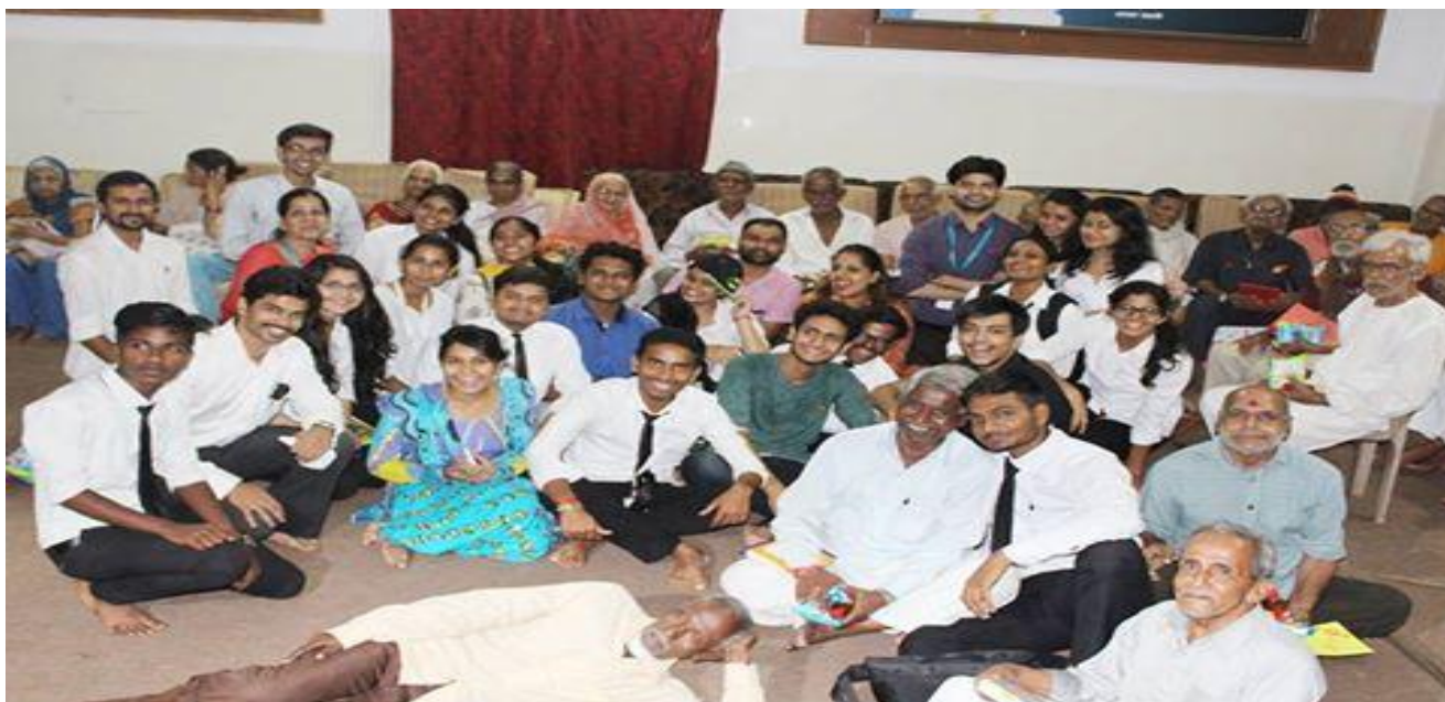
Senior citizens had a great time with Faculty members and Students of SOL, JLU.