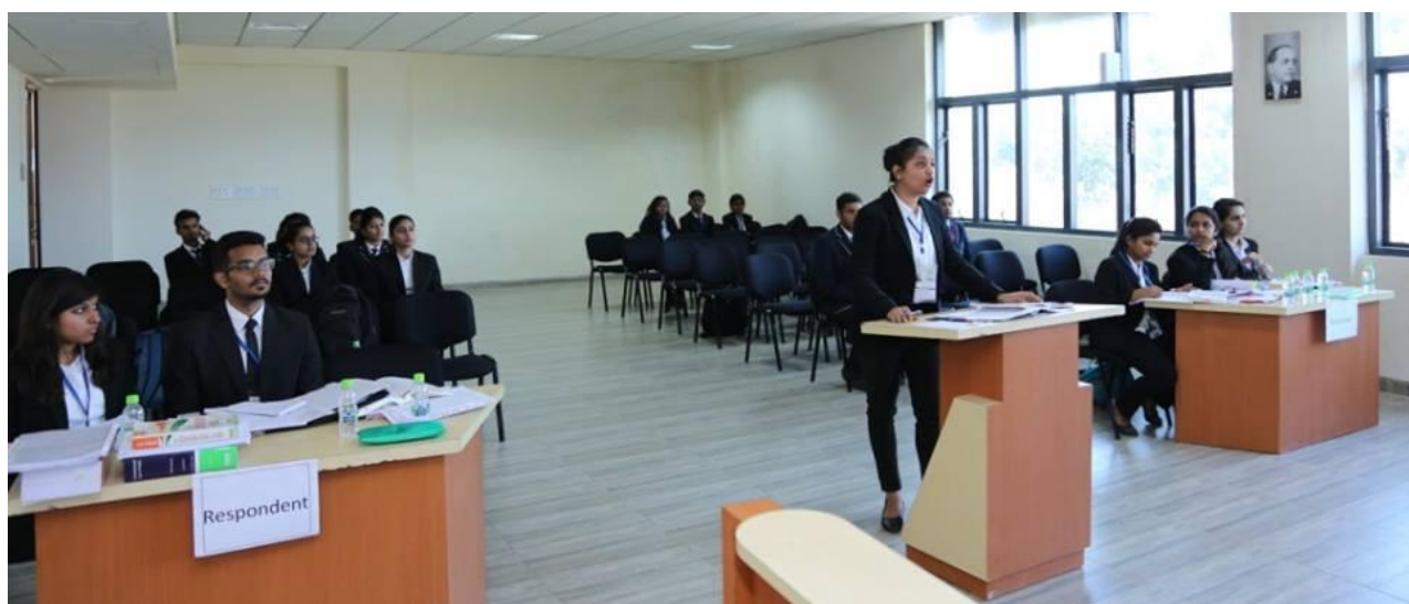
In pictures - Energetic participants competing with each other and eminent jurists judging them