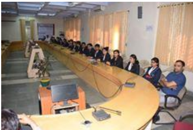
Students were briefed at the Conference Room of the District Court Bhopal.