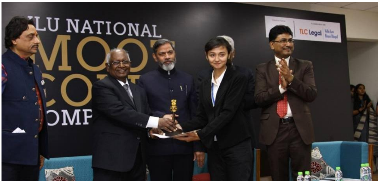
Dignitaries awarding the winners with a trophy and prize money.