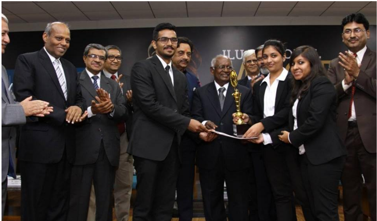
The Runners up Team was awarded cash prize of Rs. 1,00,000