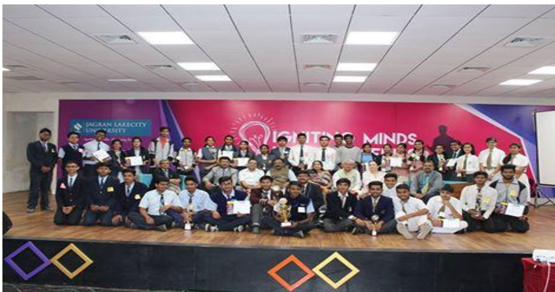
All the winners with distinguished guests present in Elaan.