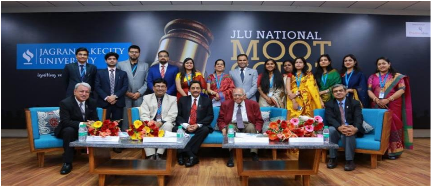
Dignitaries of JLU and faculty of SOL with the living legend Advocate Ram Jethmalani