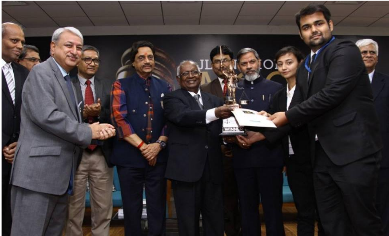
The Winner Team was awarded cash prize of Rs. 1,50,000